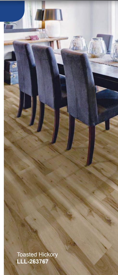
Toasted Hickory LLL-263767