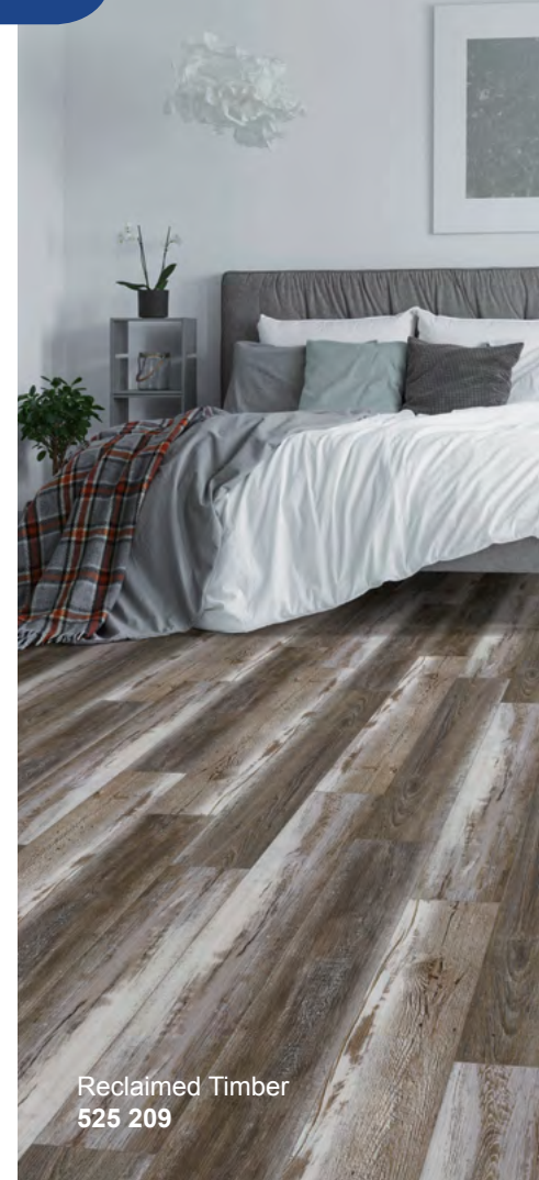
Reclaimed Timber 525 209